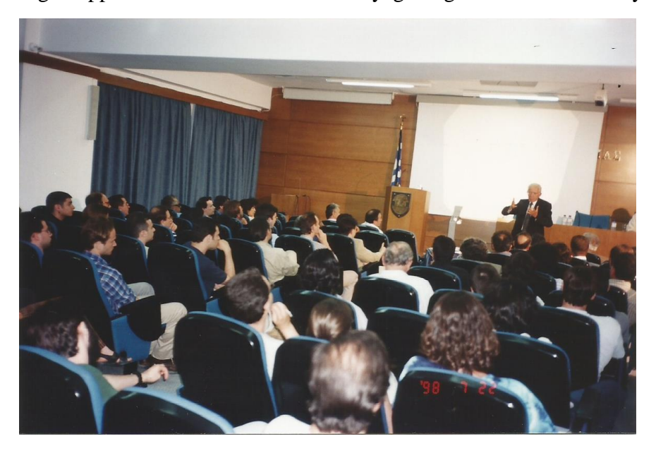
Figure 18: George Contopoulos delivering his lecture at the evening session of July 22, 1997, at the Livadia Conference Hall where we celebrated his 67<sup>th</sup> birthday.

The young sailors present in the audience were listening very carefully to his speech (see Figure 18). Perhaps now they were beginning to understand the kind of voyage they were participating in. As they watched the older sailors honoring one of their own "scientific family", perhaps now they were starting to appreciate at what shores this voyage might lead them one day.