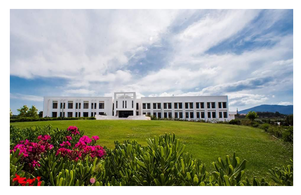
Figure 8. The main building of the Institute of Research and Technology at Heraklion.