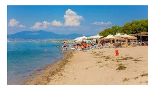
Figure 14. Above: A seaside view of Thessaloniki with its famous "White Tower". Middle: The magnificent church of Aghios Dimitrios, a "jewel" of the city. Below: A beach at the seaside town of Peraia, where the 10<sup>th</sup> Summer School was held. The city of Thessaloniki can be seen in the background.

On Sunday, that was as usual our free day, we hired a bus and went on an interesting excursion to visit the famous Petralona Cave, some 35 kilometers from Thessaloniki, on the Chalkidiki peninsula. The site was accidentally discovered in 1959 by a local shepherd and is magnificently beautiful with a complex maze of wonderfully colored stalactites and stalagmites. It became