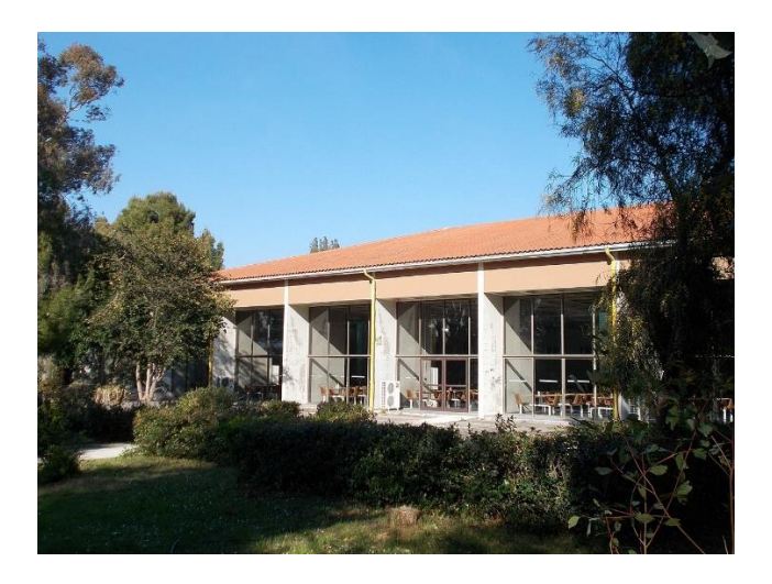
Figure 13: The restaurant "Park of Peace" at the University of Patras, where we often organized official dinners of our Summer Schools and Conferences.

Thankfully, some small campus cafeteria was always open nearby to provide refreshments. Most importantly, however, we already had at that time at the University of Patras our very own Park of Peace (see Figure 13)! This is a wonderful restaurant facility, that is still functioning today, sprawled over a wide grassy area across the street from the Rectorate of the University of Patras. The owners were certainly happy to see us visit it daily, but also helped us with our coffee-breaks and organized at the outside lawn our official Conference dinner!