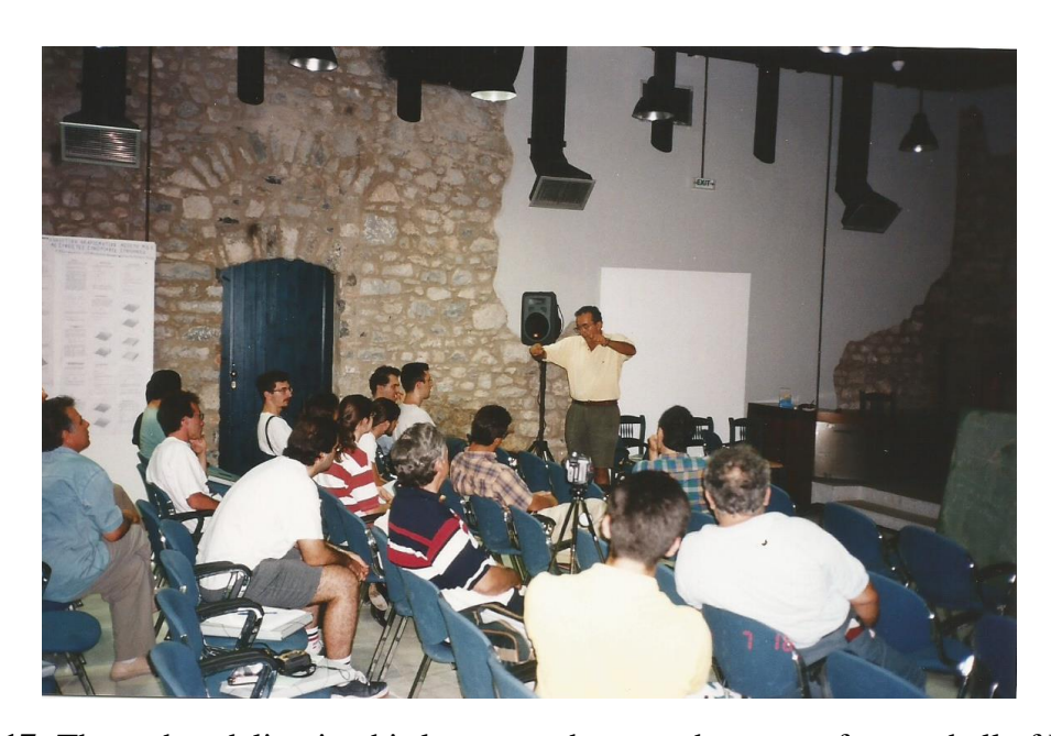
Figure 17: The author delivering his lecture at the stone house conference hall of Livadia.

To get an idea, take a look at Figure 17 below, where you see myself giving a lecture in the stone house, but the screen showing my transparencies is out of view because it is standing on a theater stage to the right of the picture! Notice also the lighting and the presence of air – conditioning pipes above our heads. Things were very different in scientific meetings those days! Still, observe the white billboard on the left. What you see on it are posters of some of the more advanced young sailors exhibiting their research!