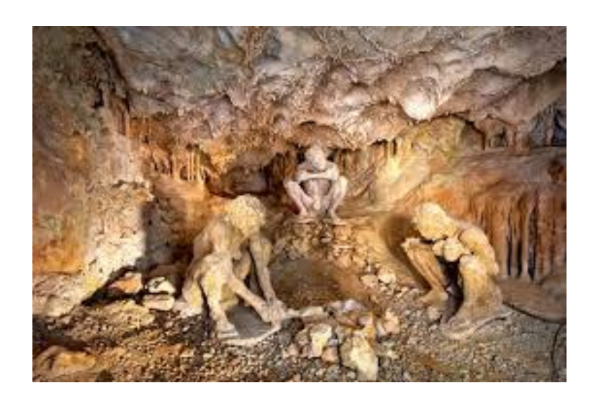
Figure 15. Photograph from the Petralona cave showing an artist's depiction of three humanoid figures as they might have lived in the cave some 200 to 400 thousand years ago.

In one of the corners of the cave the visitors have a chance to see three crouched human figures created by an artist aiming to model how people at that time must have looked as they went on with their daily activities (see Figure 15 below).