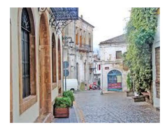
Figure 9: The city of Xanthi (above) and a characteristic street in the "old" town (below).