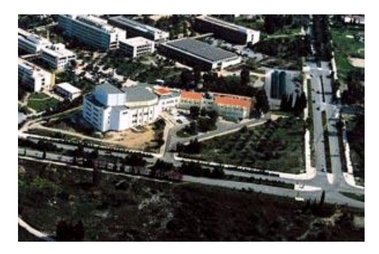
Figure 12: The Conference and Cultural Center of the University of Patras, built in 2001.

Thankfully, some small campus cafeteria was always open nearby to provide refreshments. Most importantly, however, we already had at that time at the University of Patras our very own Park of Peace (see Figure 13)! This is a wonderful restaurant facility, that is still functioning today, sprawled over a wide grassy area across the street from the Rectorate of the University of Patras. The owners were certainly happy to see us visit it daily, but also helped us with our coffee-breaks and organized at the outside lawn our official Conference dinner!